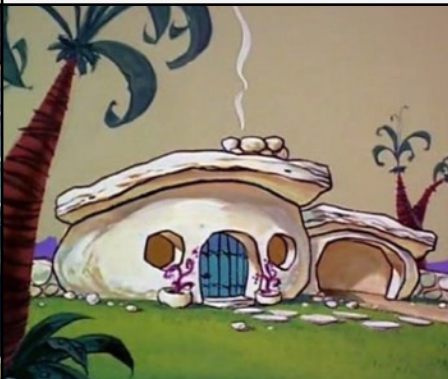
11 Fred & Wilma Flintstone.