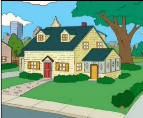
7 The Griffins (Family Guy).