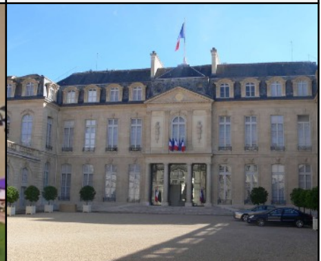
12 French President.