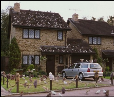
2 Harry Potter.