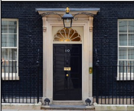
10 UK Prime Minister.