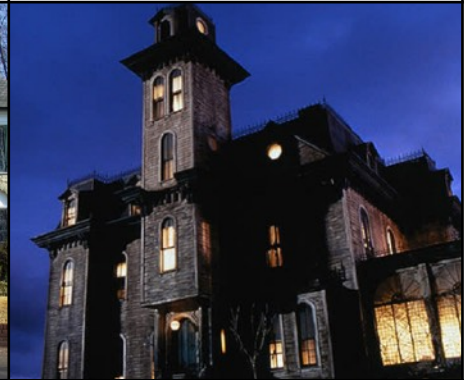
6 The Addams Family.