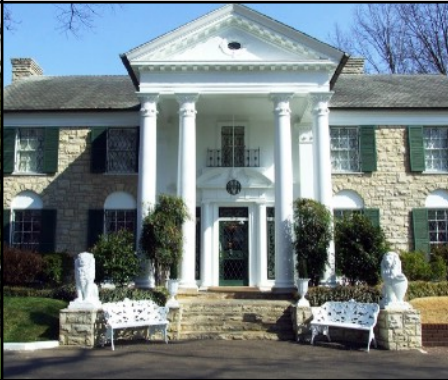
5 Elvis Presley.