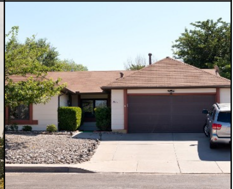
9 Walter White (Breaking Bad).