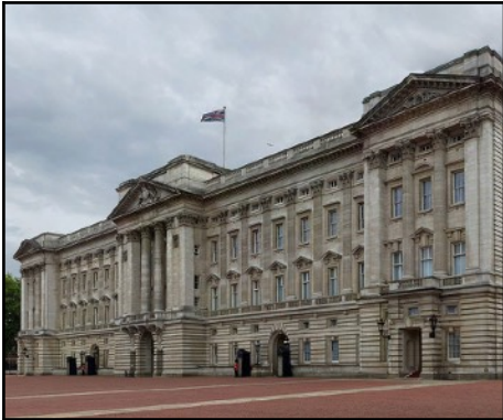
1 The Queen.

Can you name the famous occupants of these houses from fact and fiction?