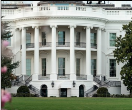
4 President of the USA.